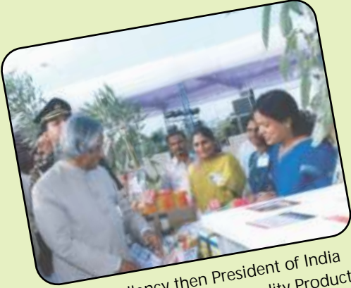
His Excellency then President of India appreciating ALPAKS for Quality Products