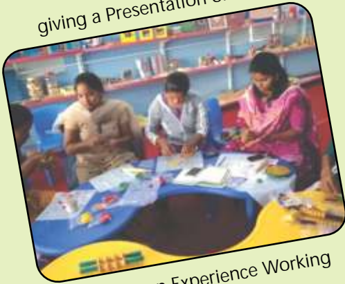
Hands on Experience Working