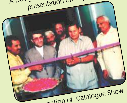
Inauguration of Catalogue Show