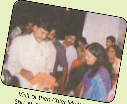
Visit of then Chief Minister Shri. N. Chandra Babu Naidu at ALPAKS